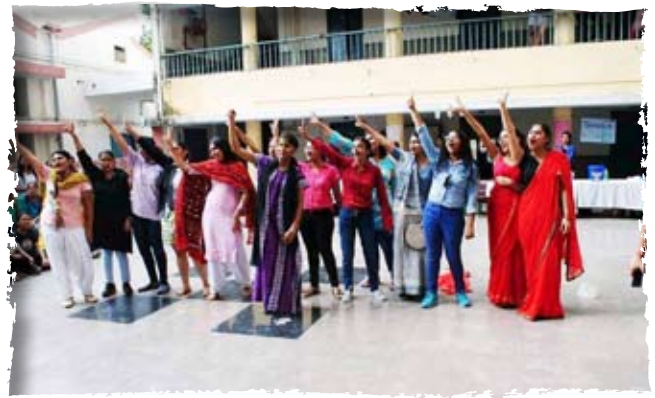
UG Hostel Day Celebration, LPMC