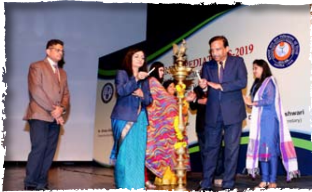
KSCH CME in Paediatrics