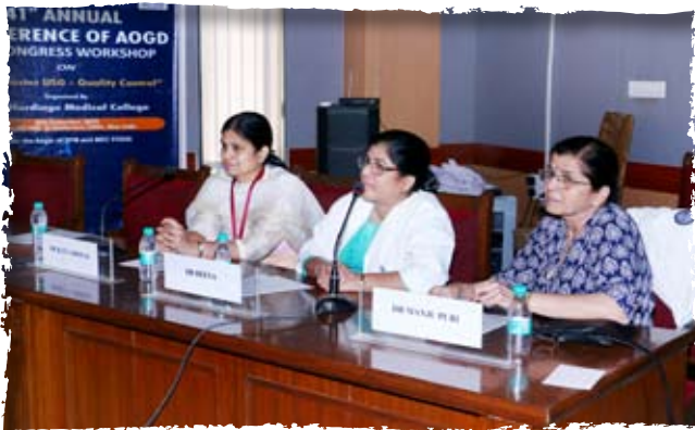
Workshop on 1st Trimester- Quality Control, Obstetrics & Gynaecology