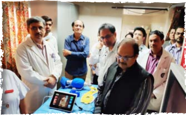
Bronchoscopy Unit Inauguration, Medicine