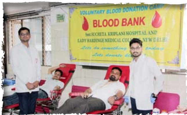
Voluntary Blood Donation Camp, Pathology & Blood Bank