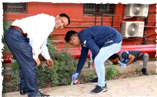
Cleanliness Drive, Gandhi Jayanti, LHMC