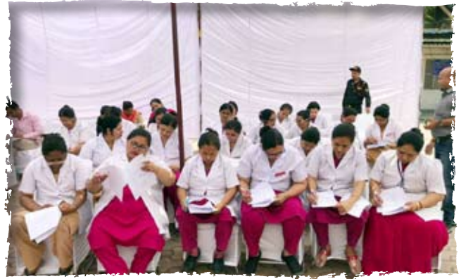
Swachhta Quiz, Accident & Emergency