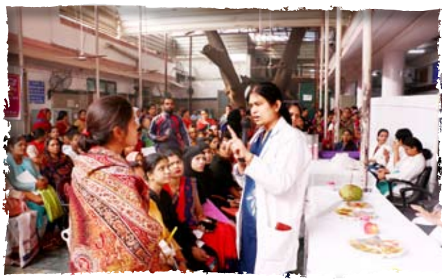
Diabetes in Pregnancy, Obstetrics & Gynaecology