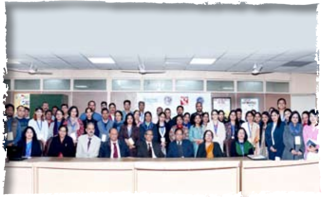
WHONET Training Workshop, Microbiology