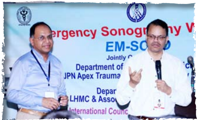
Workshop on Emergency Sonography, Medicine