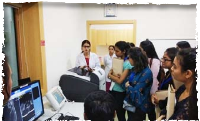
Workshop-Medical Conventus, Radiology