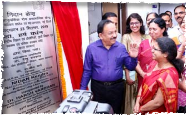
Nidan Kendra Inauguration