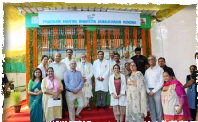
Inauguration of Jan Aushadhi Centre, LHMC