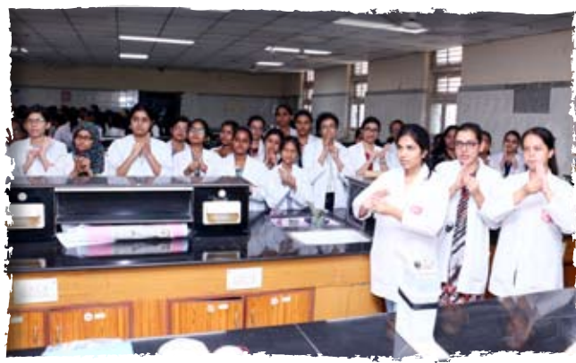
Hand Washing Awareness Drive under Swachh Bharat Abhiyaan, Microbiology