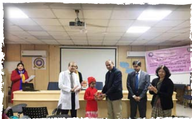
Annual function, ART centre, KSCH