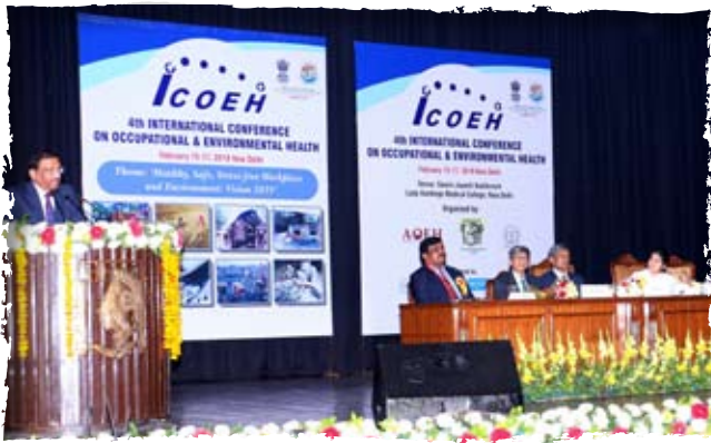
ICOEH 2019, Community Medicine