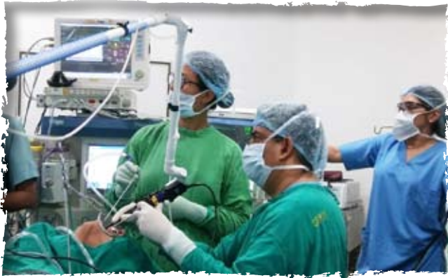
First LASER Surgery, ENT