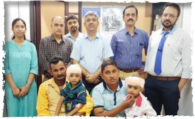
First Cochlear Implant Surgery, ENT