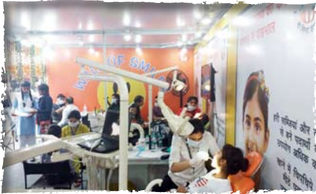
Dental & Oral Cancer Screening Camp at IITF, Dental