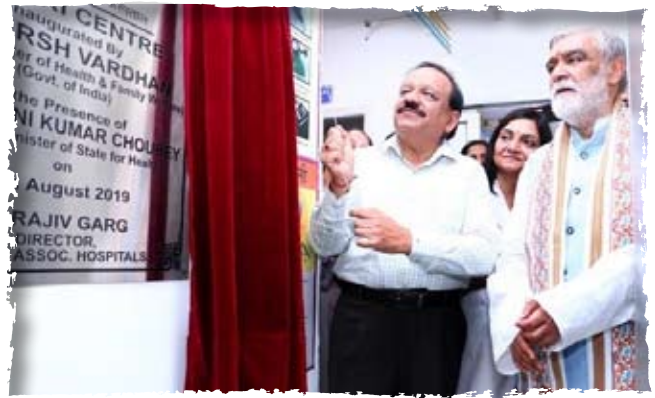
Inauguration of 3T MRI, Radiology