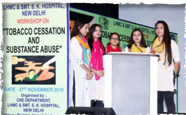
Workshop on Tobacco Cessation & Substance Abuse, CNE