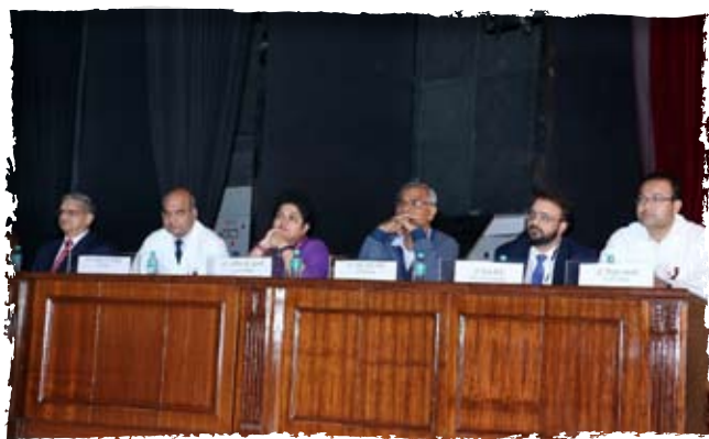
Panel Discussion on Better Health & Better Lives for Persons with Disabilities, PMR