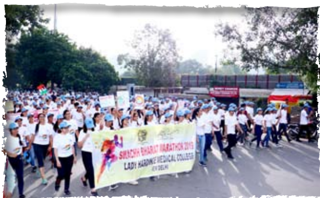
Swachh Bharat Marathon 2019