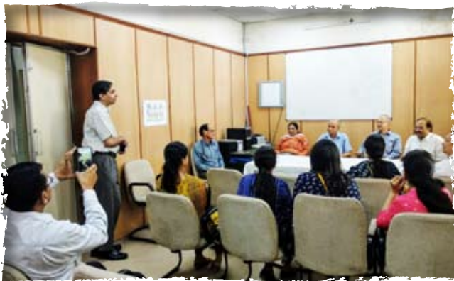
Interactive Session On World Thalassaemia Day, Medicine