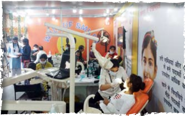
Dental & Oral screening camp, Dental & Oral cancer