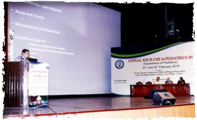
KSCH CME in Paediatrics