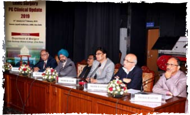
Clinical Update, Surgery