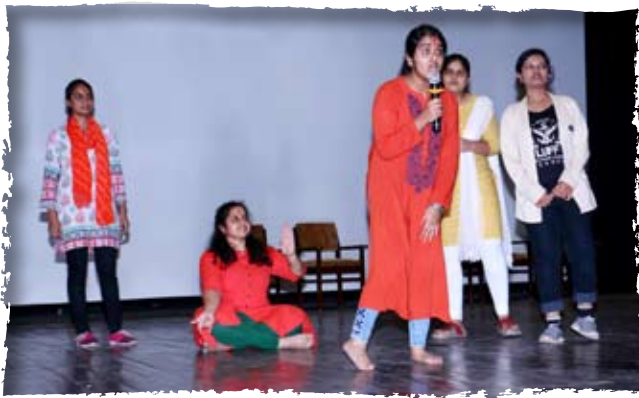
Induction Programme of New MBBS Batch, LPMC