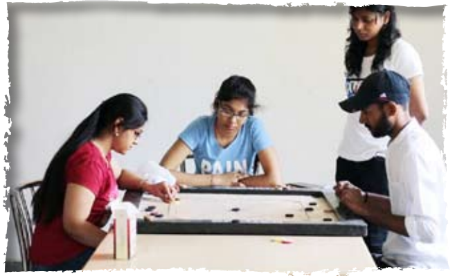
Carrom event, SPLASH, LPMC