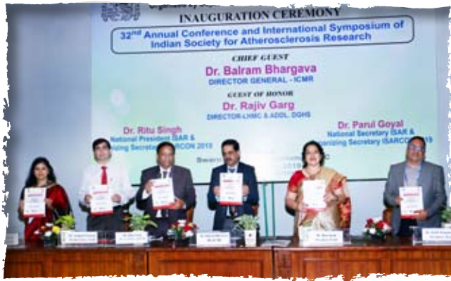
ISARCON 2019, Biochemistry