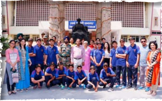
Sadbhavana Capacity building tour, Anatomy