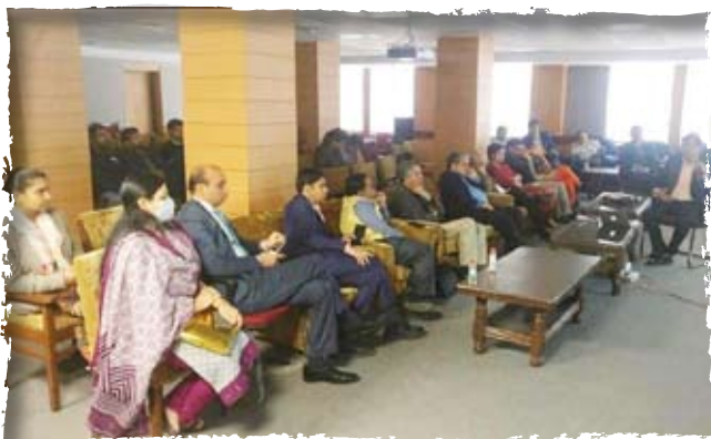
CME on Bariatric Surgery