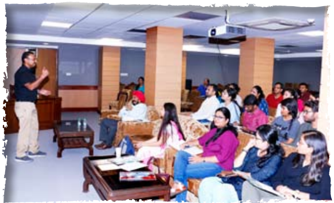
Workshop on Safe Motherhood