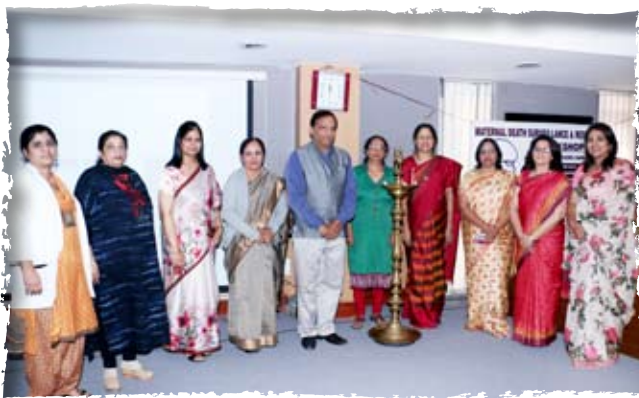
Workshop on Maternal Death Surveillance & Response, Obstetrics & Gynaecology