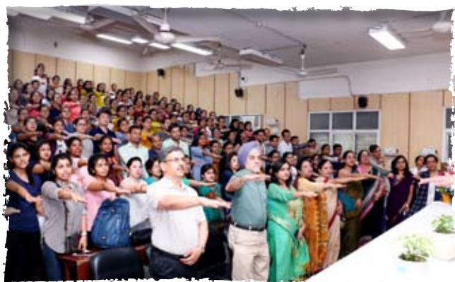
Pledge Against Hepatitis B & C, Microbiology