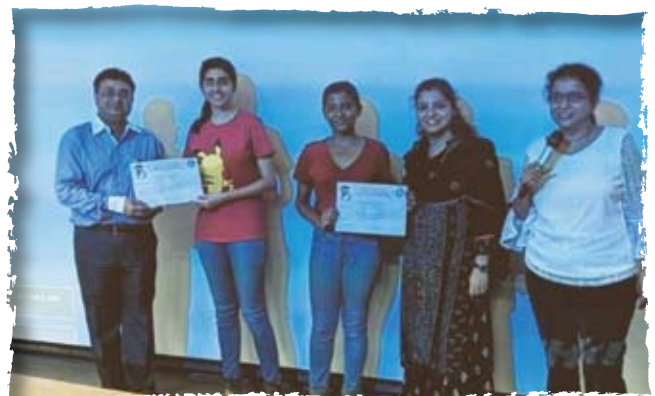
Delhi State Level IAPM Undergraduate Pathology Quiz