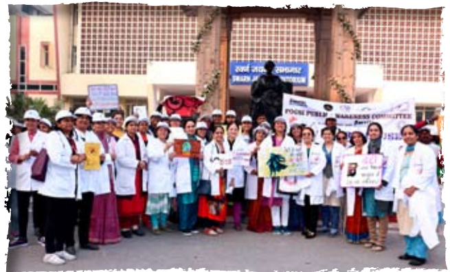
Walk for a Cause, Obstetrics & Gynaecology