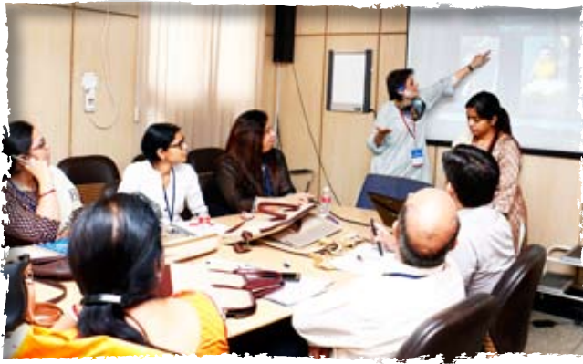
Training of Trainers, KSCH