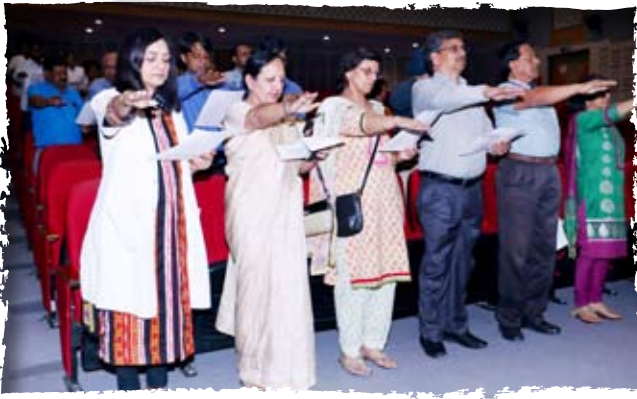
Pledge for Vigilance Awareness, LPMC