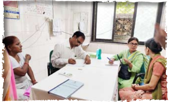
IADVL Meet, Dermatology