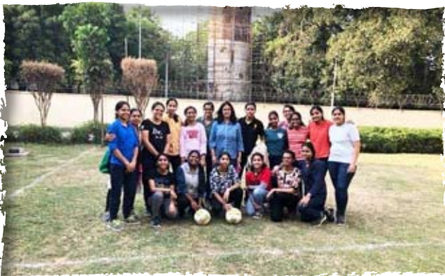
Volleyball Team, LPMC