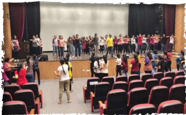
Self Defence programme, Physical Education unit, LHMC