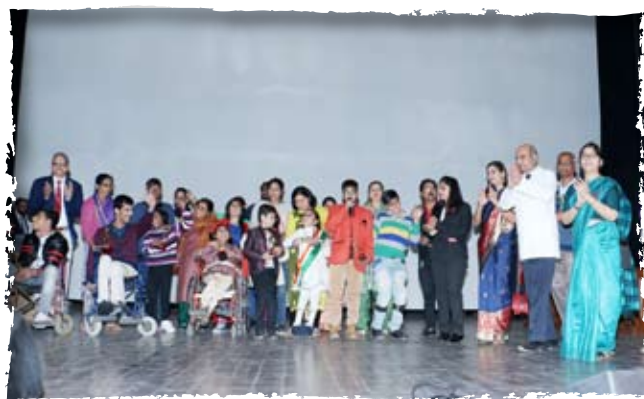
Celebration of International Day of Person with Disabilities, PMR