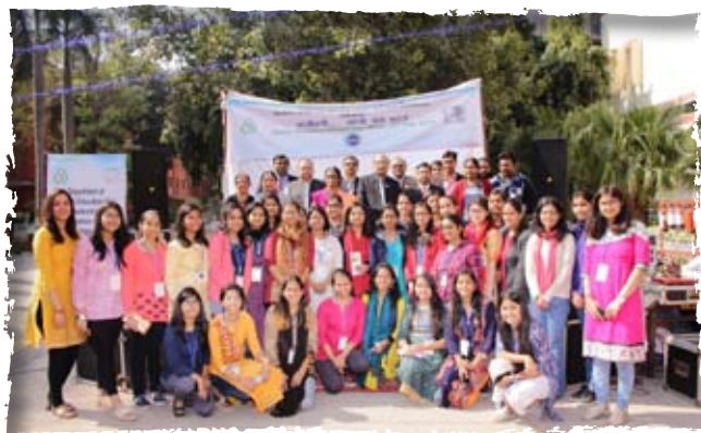
SLM, Organ Donation Awareness, MEU