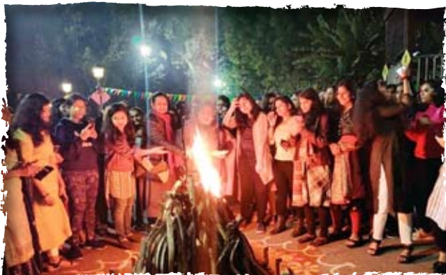
Lohri celebration, UG hostel, LPMC