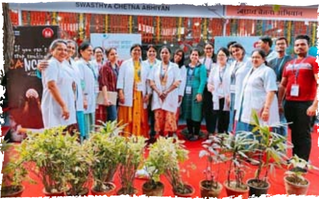
Swasthya Shivir at IITF, Accident & Emergency