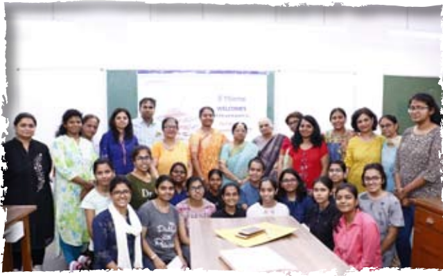
Anatomy art competition