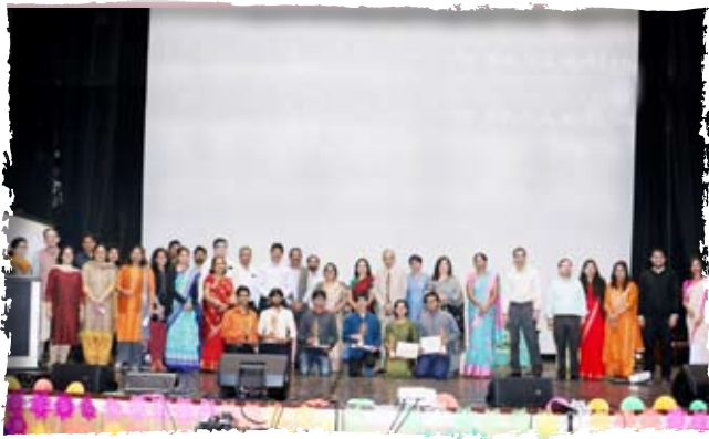
5th Intercollegiate Physiology Quiz for UG students