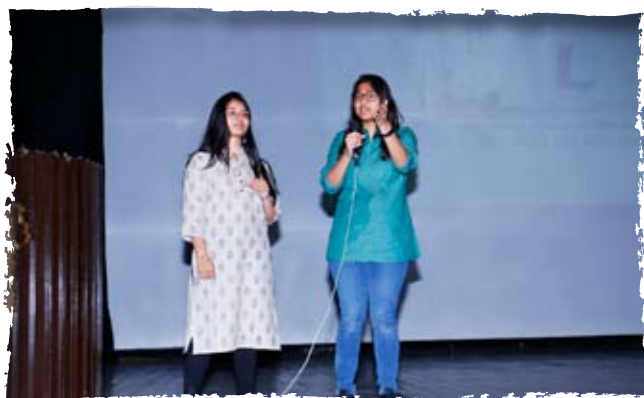
SLM, Stress Management, MEU