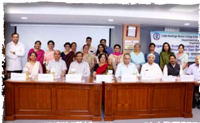
National organ and tissue transplant organisation awareness, Anatomy