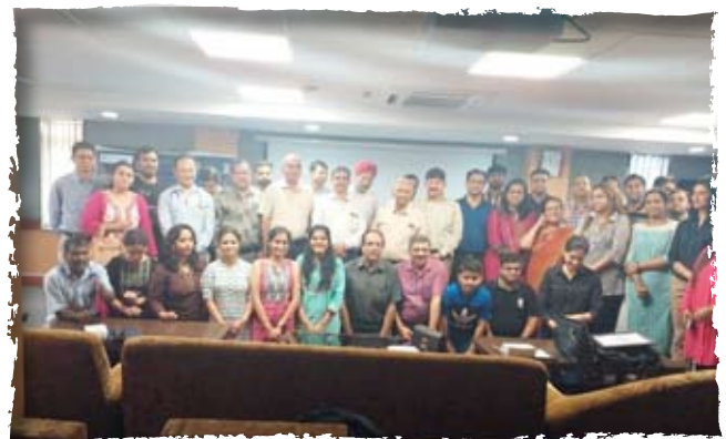
CME on World Heart Day, Dental