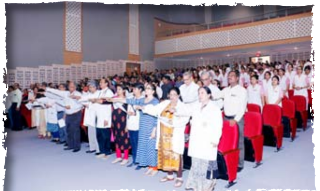
Pledge for Swachh Bharat Abhiyan, LPMC