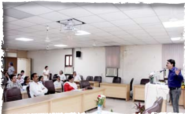
TOT of faculty in infection control practices, Microbiology