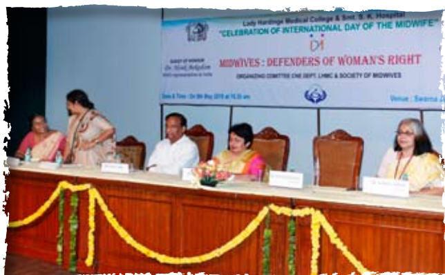
Celebration of International Day of the Midwife, CNE