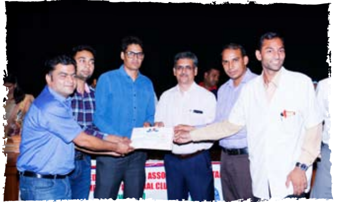
Employees cultural club activity, LPMC