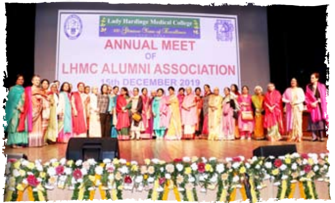
LPMC Alumni Reunion Function