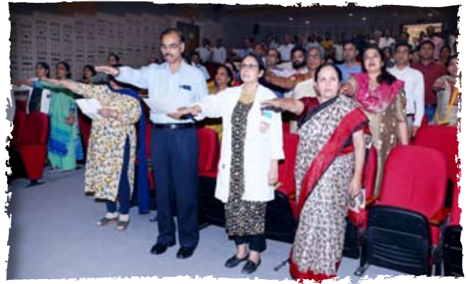
Rashtriya Ekta Diwas, Pledge of Unity, LPMC