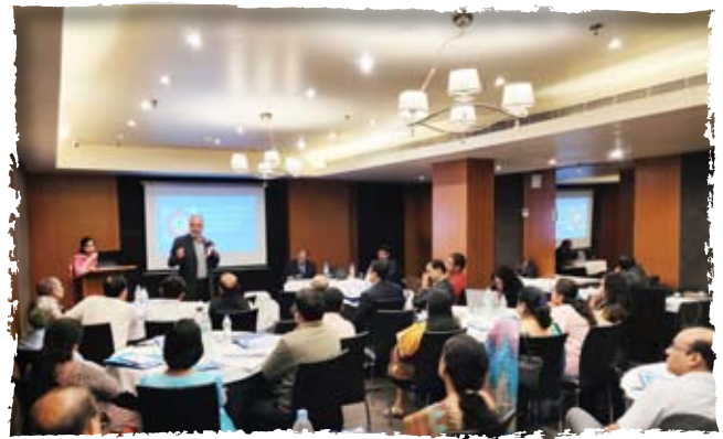
SCoE Network Meeting, Paediatrics