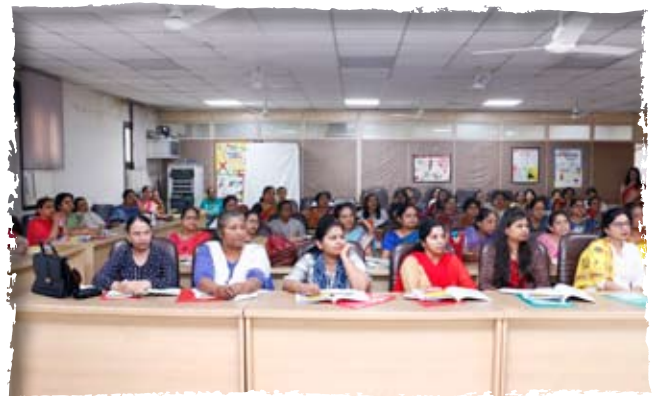
Training of Nurses on Infection control, Microbiology