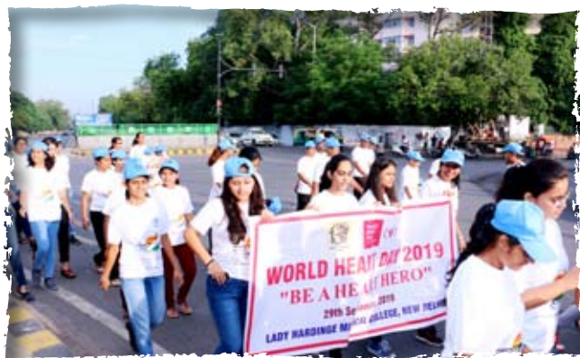
World Heart Day Marathon 2019