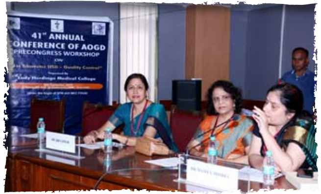
Annual conference AOGD, Obstetrics & Gynaecology