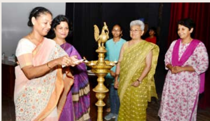
Symposium on Emotional intelligence, Anatomy