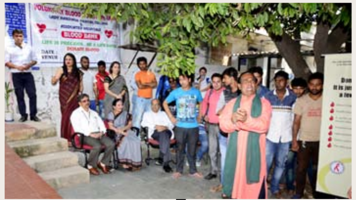
Voluntary Blood Donation camp, Pathology & Blood Bank