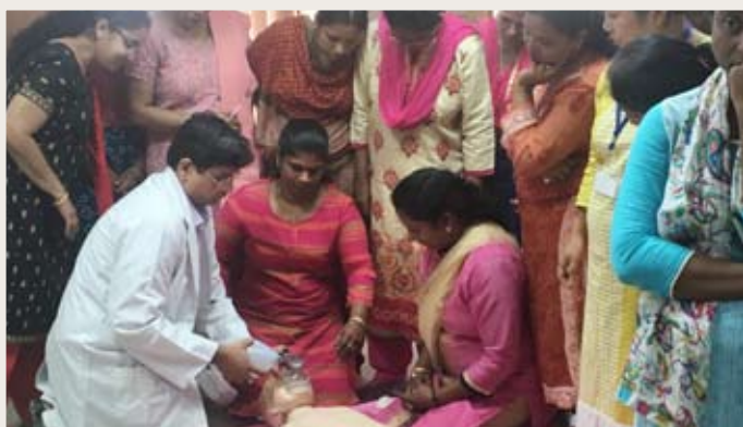
BLS Training of nurses under CME cell, LHMC