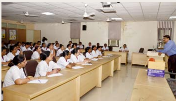
Swachhata Abhiyan Kaya-Kalp Project Training Programme for HCWs, Microbiology