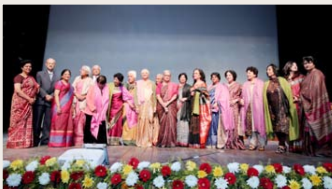
LPMC Alumni reunion function