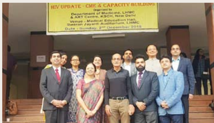
CME on HIV Update, Medicine & ART centre KSCH