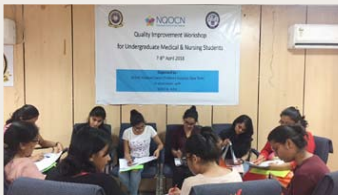
Quality improvement workshop for UG medical & Nursing students, QI cell