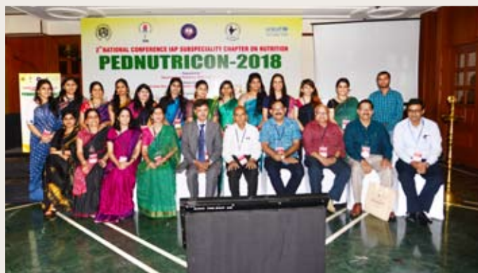
PEDNUTRICON, Paediatrics KSCH