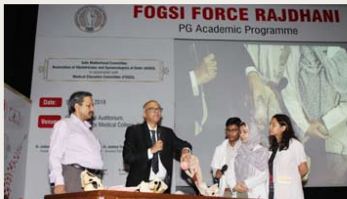
FOGSI FORCE RAJDHANI, PG Academic programme, Obstetrics & Gynecology