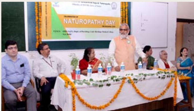
Celebration of Naturopathy Day, Physiology