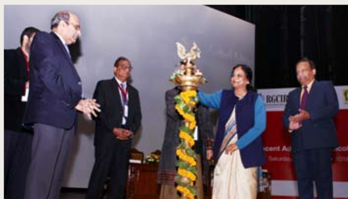
CME on Advances in Oncology, KSCH