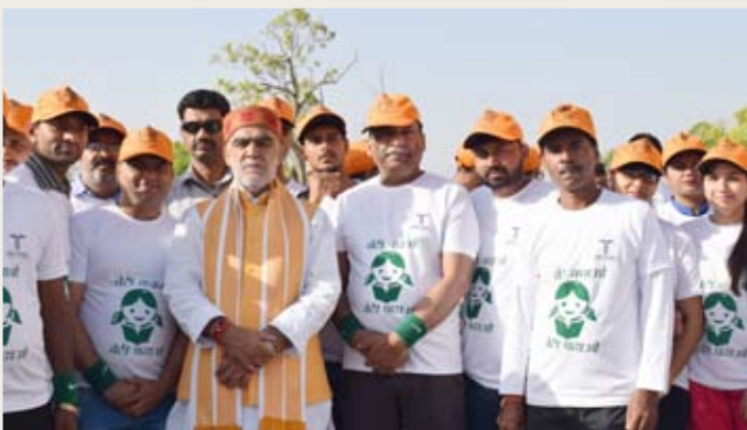
Beti Bachao Beti Padhao, LPMC