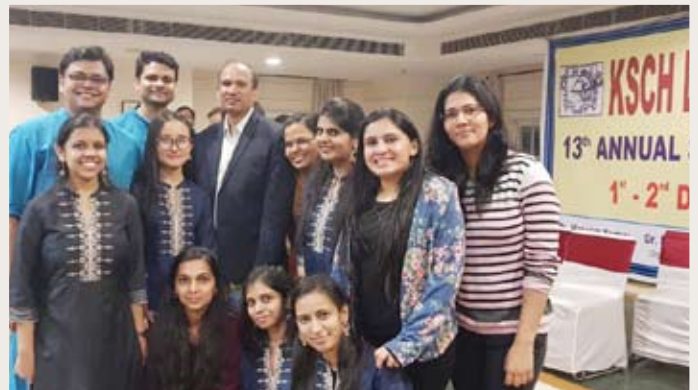
Annual get together, KSCH