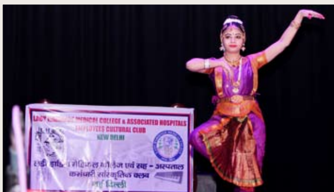
Employees cultural club activity, LPMC