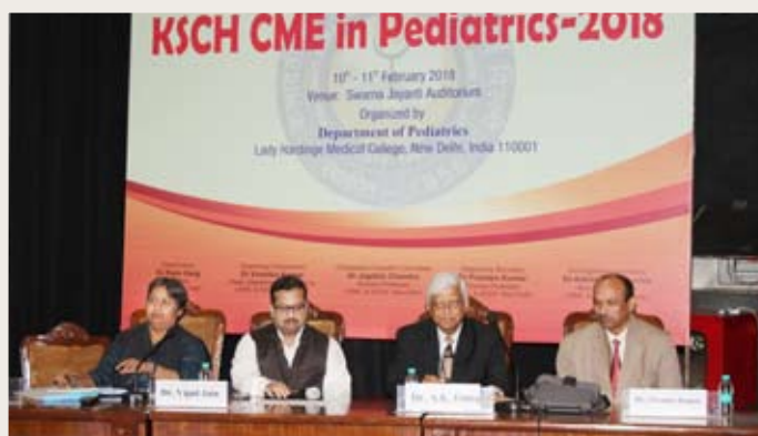
KSCH CME in paediatrics