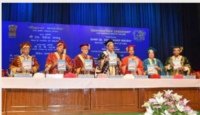
Convocation 2018 & Launch of annual report