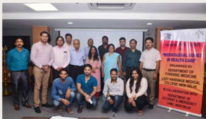
Medicolegal issues in health care, Forensic Medicine