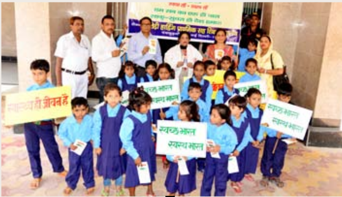
Swachh Bharat Abhiyaan, LPMC