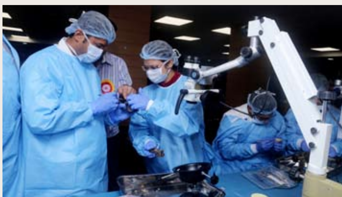
1st Basic temporal bone workshop, ENT & Forensic Medicine