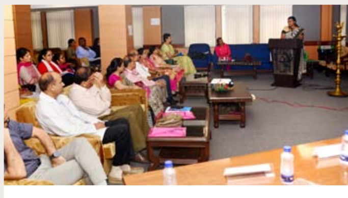
Workshop "On road to excellence in nursing practice", CNE cell