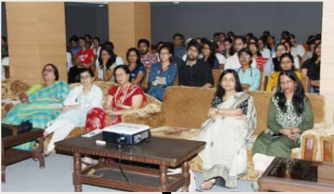
Induction Programme of new PG batch, LHMC