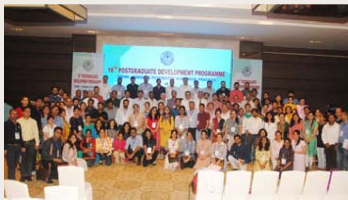
18th Postgraduate Development Programme, Psychiatry