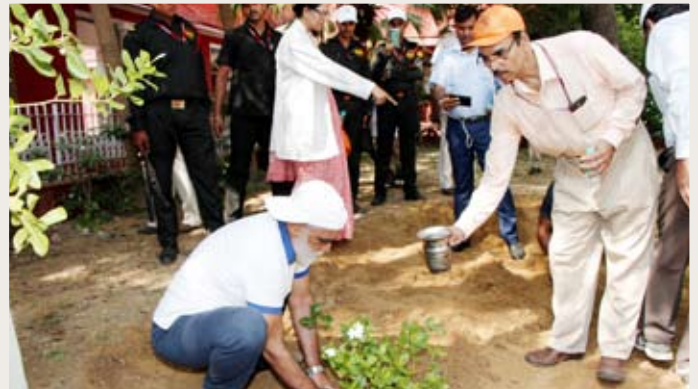
Plantation drive, LPMC