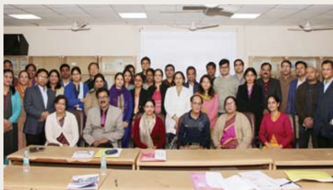
Training of trainers on "Hospital infection control", Microbiology