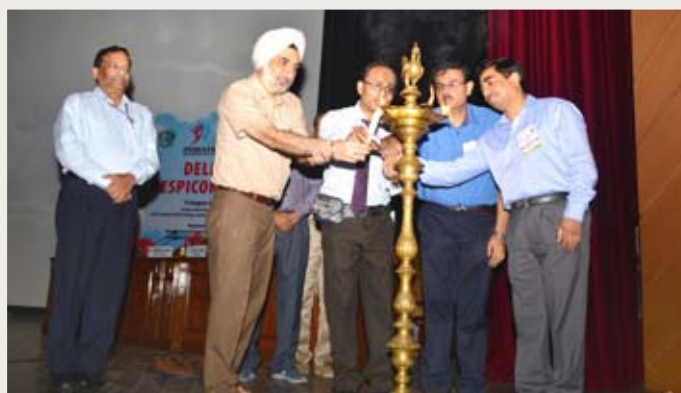
Delhi RESPICON, Paediatrics KSCH