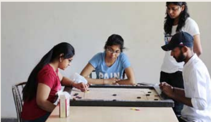
Sports event in SPLASH, LHMC