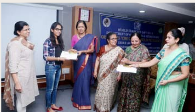
CME on World Diabetes day, Obstetrics & Gynecology