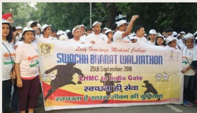
Swachh Bharat walkathon