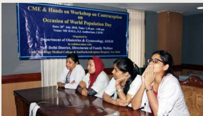
CME on Contraception, World population day, Obstetrics & Gynecology