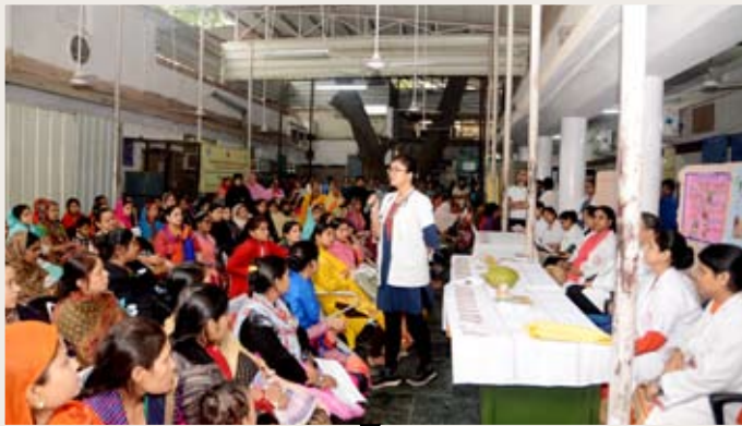
Diabetes in pregnancy, Obstetrics & Gynecology