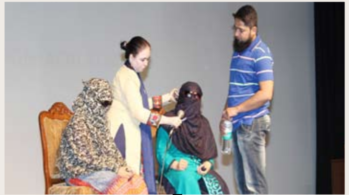
SLM, Law & ethics, MEU