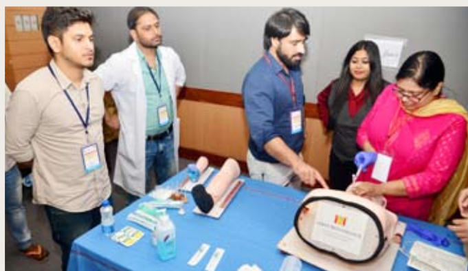
Acute critical care course, Surgery