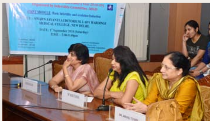
PG Training programme on infertility, Obstetrics & Gynecology