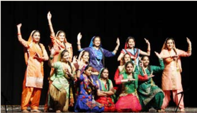
Cultural programme in SPLASH, LHMC