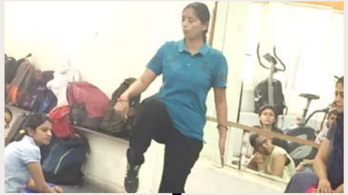
Self defence programme, Physical education unit, LPMC