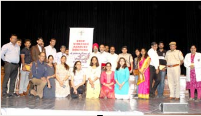
SLM, Stop violence against doctors, MEU