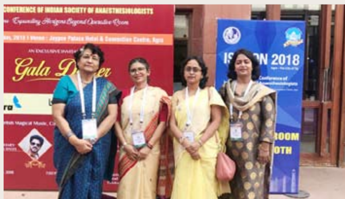
ISACON 2018, Anaesthesia