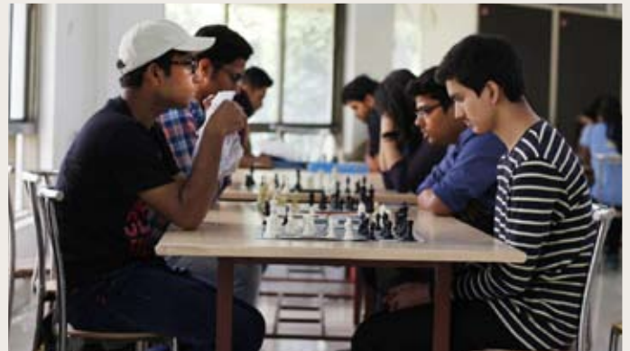
Sports event in SPLASH, LHMC