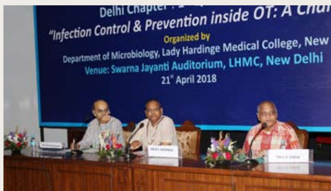
Workshop on "Infection control & prevention inside OT A challenge", Microbiology