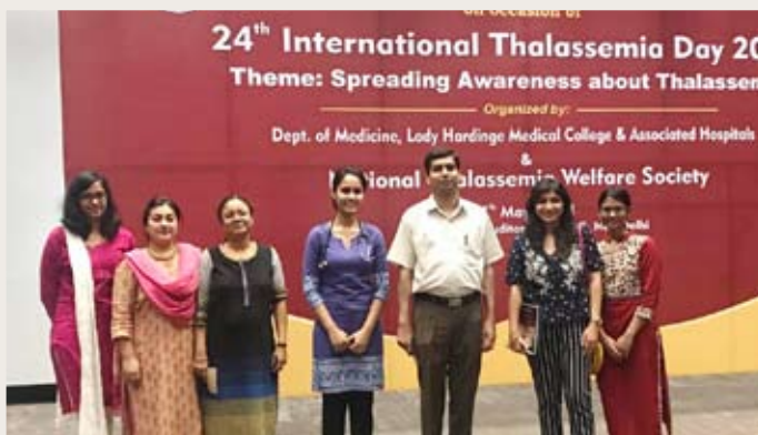
CME on Thalassemia, Medicine