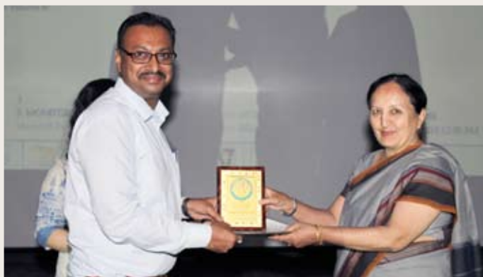
CME on "World TB day", Community Medicine