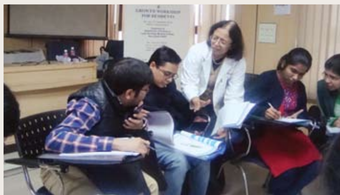
Pediatric Endocrinology CME, KSCH