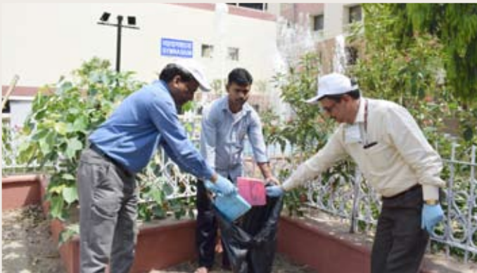
Cleanliness drive under Swachh Bharat Abhiyaan, LPMC