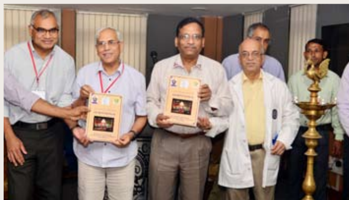
Launch of Student Manual for acute critical care course, Surgery