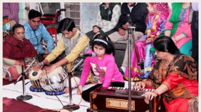
Celebration of International day of person with disabilities, PMR