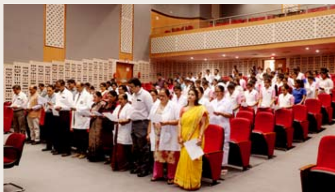
Rashtriya Ekta Diwas, 'Pledge of Unity', LPMC