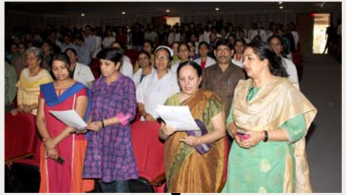
Pledge for Swachh Bharat Abhiyan, LHMC