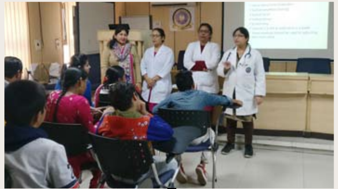
Awareness programme on World Diabetes day, Paediatrics