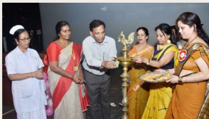
Nursing Day celebration, LPMC