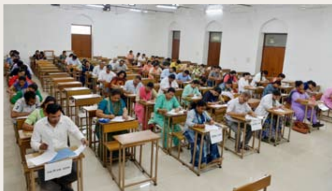
Hindi Pakhwada, LPMC