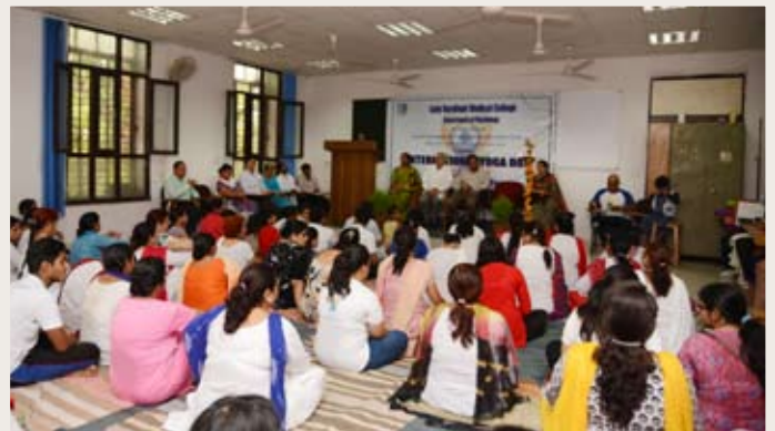
Celebration of International Yoga day, Physiology