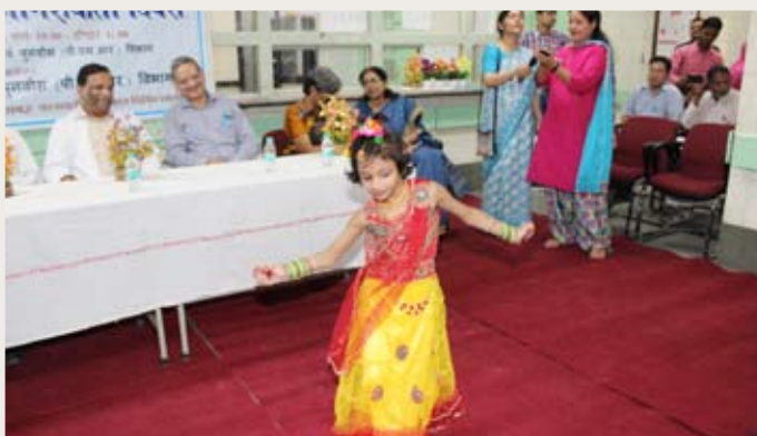
Celebration of World Autism awareness day, PMR