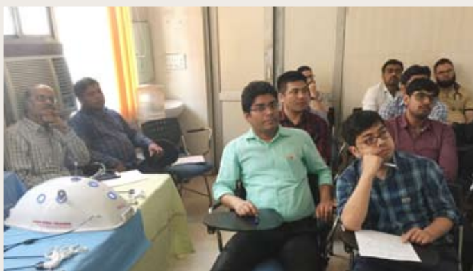
Laparoscopic Workshop, Pediatric Surgery