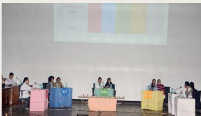
3rd Inter-collegiate Physiology Quiz for UG studentsbiology