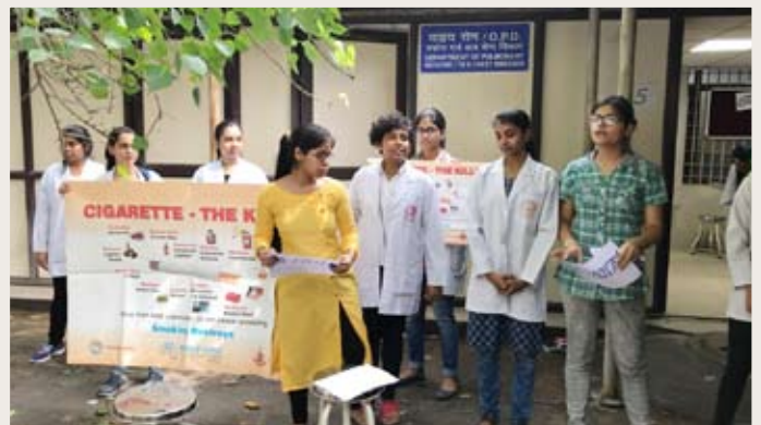
SLM Smoking Kills Outreach programmes for patients' and their attendants