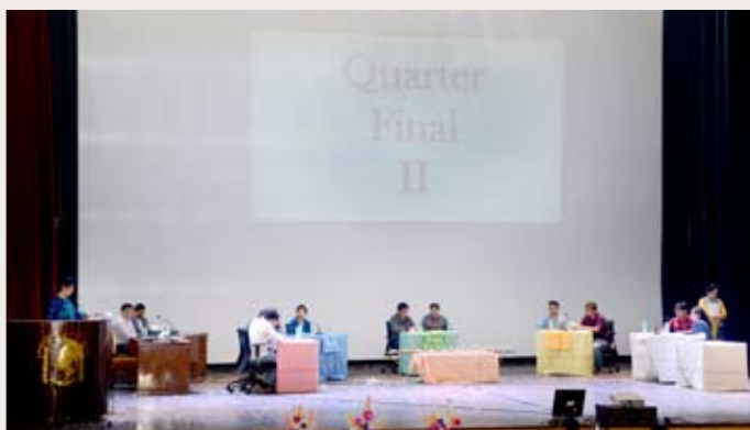
4th Inter-collegiate Physiology Quiz for UG students