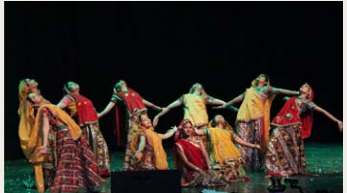
Cultural programme in SPLASH, LHMC