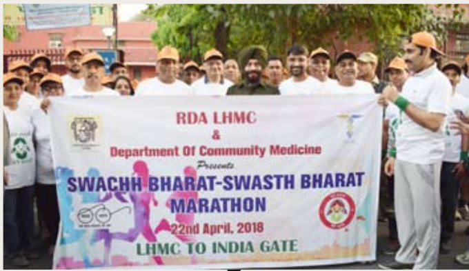
Swachh Bharat-Swasth Bharat Marathon, Community Medicine