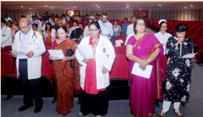
Pledge for Vigilance awareness week, LHMC