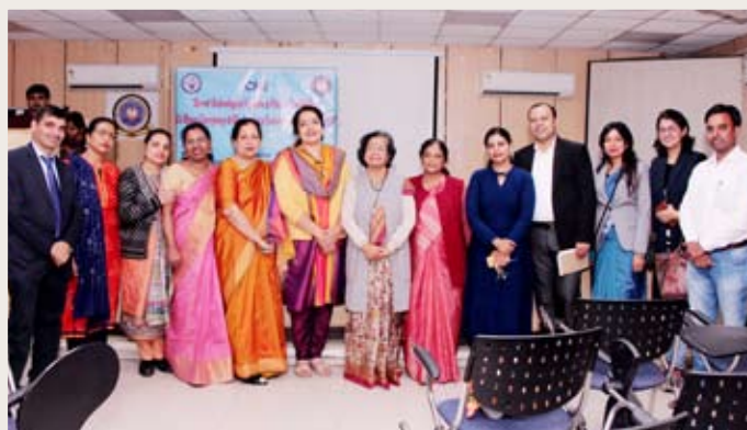
CME Biochemistry, KSCH