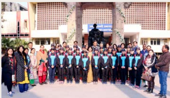
Sadhbhavana "Capacity building tour", Anatomy